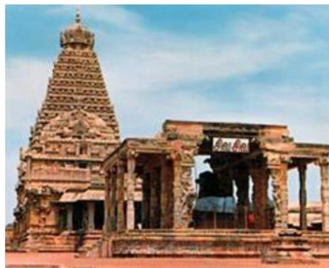
A famous temple built by the Cholas in Gangaikondacholapuram