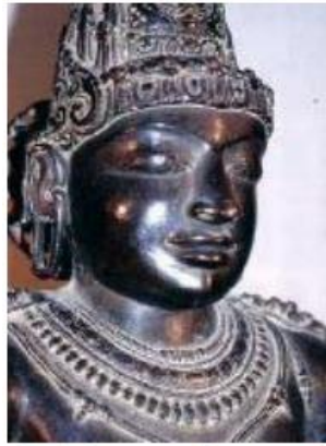
A deity made up of bronze during the Chola dynasty