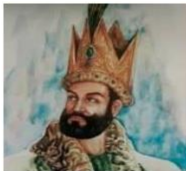
Mahmud of Ghazni raided the Indian temples which were centres of wealth. With the plundered money, he built the splendid city of Ghazni in Central Asia.