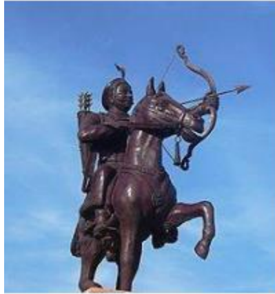
Statue of Prithvi Raj Chauhan at Ajmer